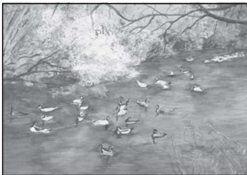
The Pond Watercolor Reva Power

Please come and invite all your friends! HOPE TO SEE YOU THERE! For Information Email: vronstadt@yahoo.com